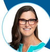
Catherine Wood Founder, CEO and CIO, ARK Invest

“ We believe that innovation is key to growth in a portfolio. According to our research, the global economy is undergoing one of the largest technological transformations in history, displacing industry incumbents and creating new leaders, enablers, and beneficiaries of disruption innovation. ”